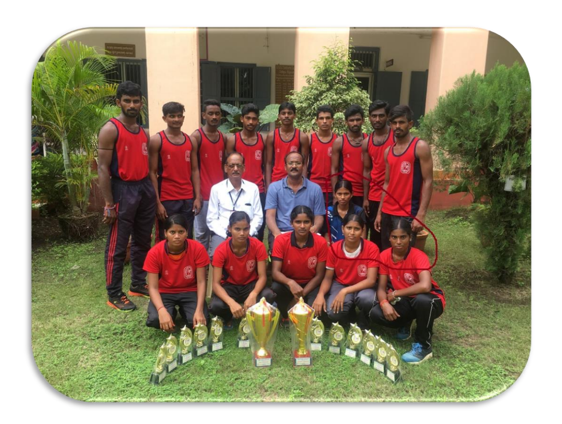
AG & SG Students selected for South Zone inter University Cross Country (Women) Tournament

5. The Krishna University all IndiaIntercollegiate Cross Country(Men&Women) Coaching Camphas been organized in the college premises from 21-10-2017 to 27-10-2017.