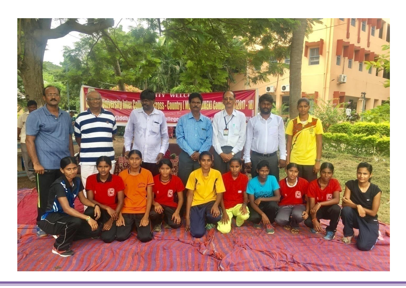
AG & SG Students selected for The Krishna University all India University Cross Country(Men&Women) Coaching Camp

6. The Krishna University all India IntercollegiateKabaddi(Women) Tournament on 10-11-2017 to 13-11-2017 .