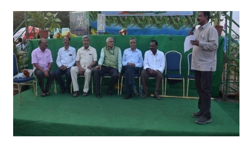
AG & SG Students selected for TheKrishna University all IndiaIntercollegiate Athletics Championship (Men&Women)

8. TheKrishna University all India Intercollegiate Athletics Championship (Men&Women) Coaching Camp on 05-12-2017 to 11-12-2017.