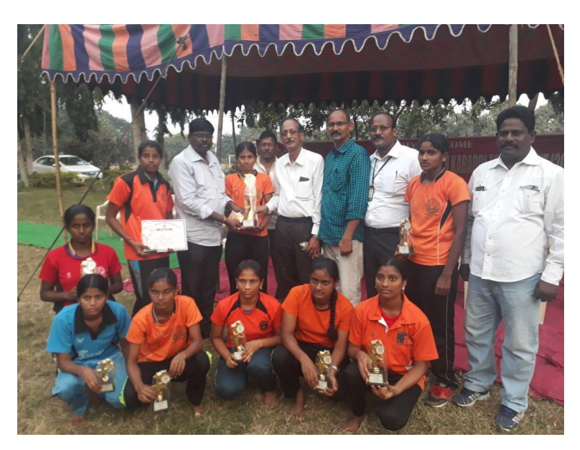
Name of the Event: Krishna University all India IntercollegiateKabaddi(Women) Coaching Camp

6. The Krishna University all India IntercollegiateKabaddi(Women) Tournament on 10-11-2017 to 13-11-2017 .