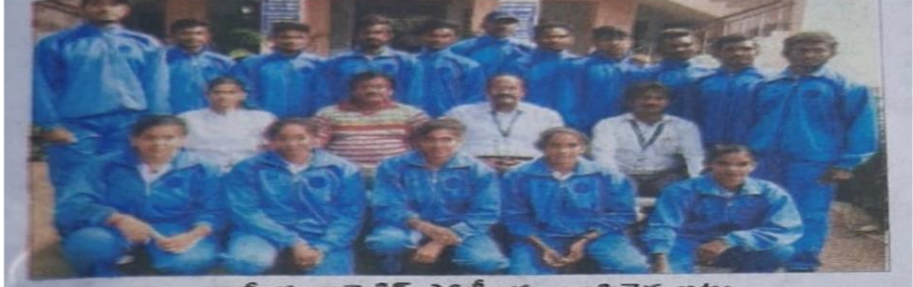
జాతీయ అథ్లెటిక్ పోటీలకు ఎంపికైన జట్టు