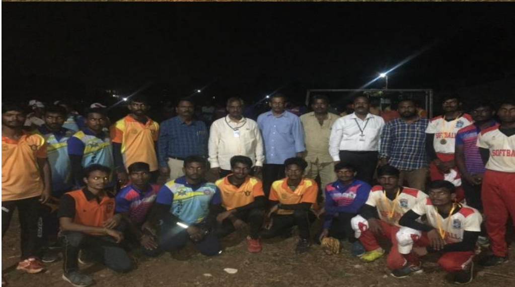
AG&SG Students selected for Krishna University All India Inter University Softball Team (Men) Coaching Camp