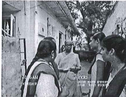
Awareness Programme on “DhomalubhabhoyeDhomalalu”

3. Programme Name: N.S.S Special Camp in the village Tadanki