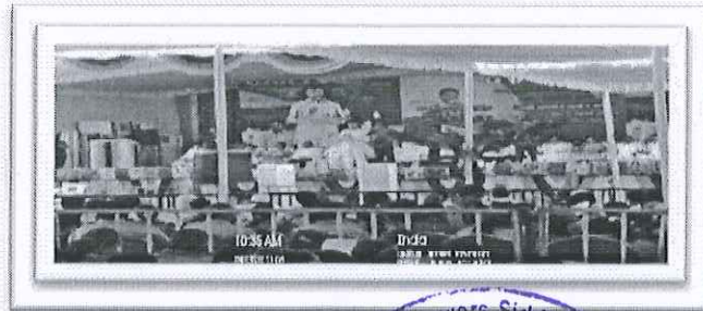
Janmabhoomi Maavooru Activities