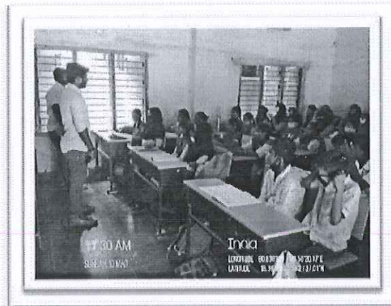
Bala Kishori Vikasam programme

8. Programme Name: N.S.S Special Camp in the village Aginapadu