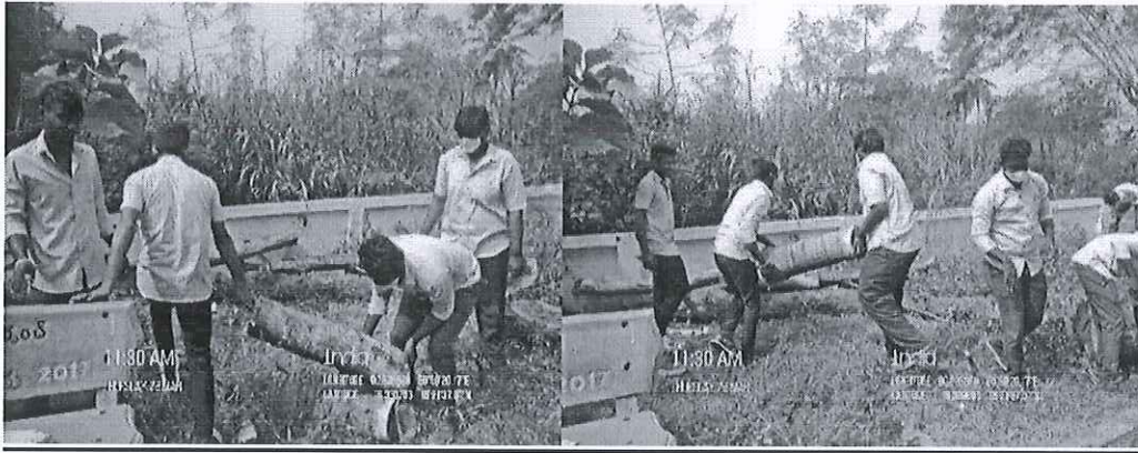
N.S.S Special Camp in the village Veranki Laku