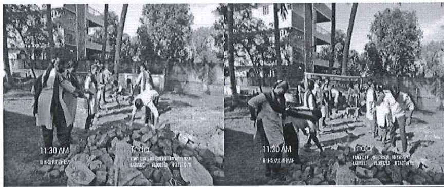
N.S.S Special Camp in the Aginapadu village

9. Programme Name: N.S.S Special Camp in the village Veranki Laku