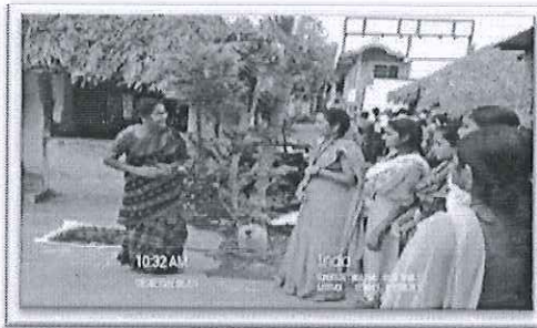
Awareness Programme on Navanirmana Diksha

2. Programme Name: Awareness Programme on “DhomalubhabhoyeDhomalalu”