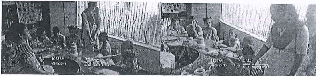
Services in Sirisha Rehabilitation Center