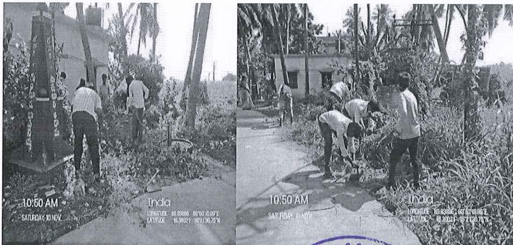
N.S.S Special Camp in the Tadanki Village