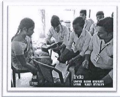
Grama Darshini Programme

6. Programme Name: Janmabhoomi Maavooru Program