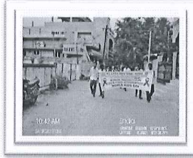
World Aids Day rally

5. Programme Name: Grama Darshini Programme in 20 wards under VuyyuruNagarapanchyati